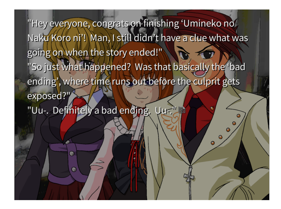
Fig. 1. Characters in the first episode epilogue, discussing the the ending of the episode in branching narrative terms.