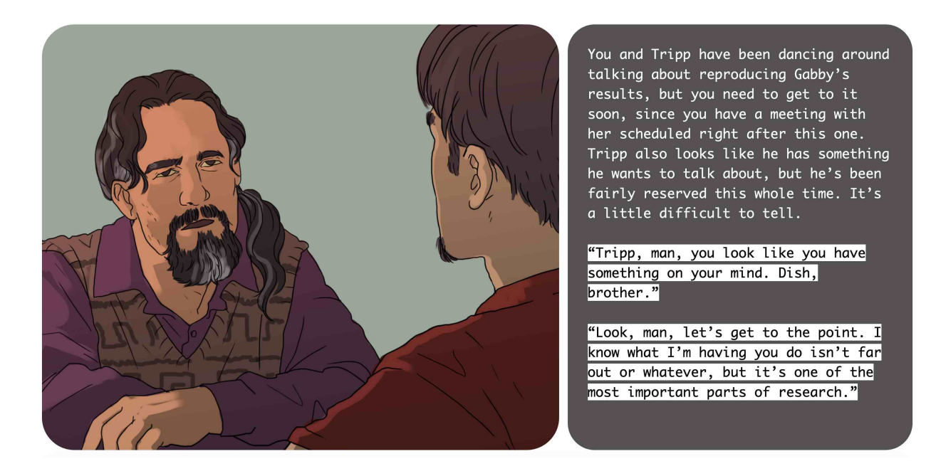
Figure 1: A choice point from Academical's final scenario, "Fallen Angel Y2K." In this scene, the player controls a busy professor whose graduate student suspects that a postdoc in the lab has fabricated research results. The two highlighted text blocks represent dialogue options between which the player must select.

supported by their grants to receive RCR training [30, 33]. Currently, the NIH provides a guideline of nine core RCR topics: 1) conflict of interest , 2) human and animal subjects , 3) mentoring , 4) collaboration , 5) peer review , 6) data man agement , 7) research misconduct , 8) authorship and pub lication , and 9) scientists and society [13]. Past research on RCR education has ranged from issues teaching ethical theories underlying RCR [2] and identifying metacognitive reasoning strategies that facilitate ethical decisionmaking [17] to the use of group mentoring [48] and roleplaying [3, 40] for improved efficacy. However, there is still